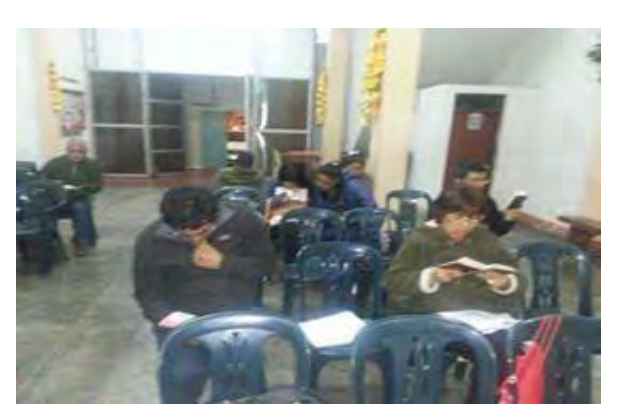
Our brothers and sisters in Comas studying their Bibles.