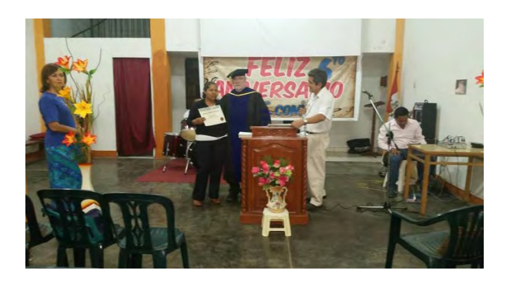
One of our sisters getting her certificate. Praise the Lord! @

In Comas they also lived the experience of having their mini grad. They were really looking forward to celebrating this event as they have finished quarter 3, regarding tithing. This group is the one that has been studying the longest so I consider they really deserved this mini graduation. Praise the Lord! ③. In addition, I hope that after this quarter, the tithing and offerings increase in this church! ⑤