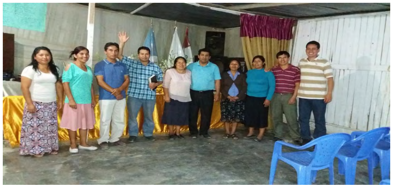
This time you can see me in the photo. I wanted to appear there! © The meeting was very productive and positive.