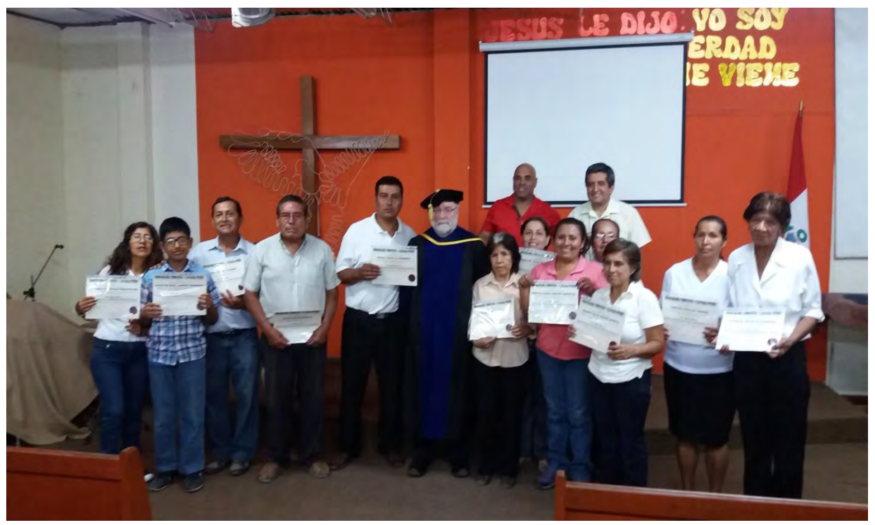
I would never finish this report if I had to put each of the graduates' photos. So, I send you this whole class pic where you can see the TPI class in IBE Villa el Salvador Campus in Lima. May God bless them more and more every day!