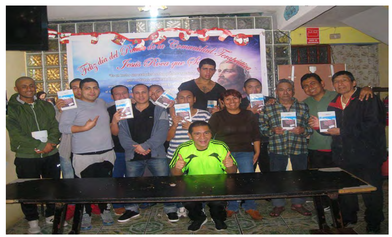
Praise the Lord! TPI Bibles for new Sons of God. @