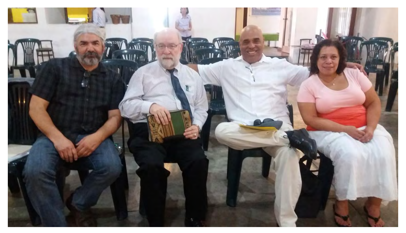
The delegations are here. Before the first serivece starts... There's always a moment to have a photo. ©