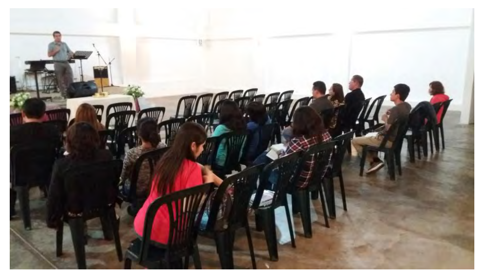
We were only 15 last Wednesday, but we learned a lot, that's important! @

After learning the principles of the Family Altar, it's was very clear to us how important it is to bless our children with the Priestly Blessing. We have the power in our mouth to curse or to bless people and that includes our children. We also studied Numbers 6: 22-27, which was the main topic on our last class. About 15 people attended last week at IBE Surco. Pastor Jorge was very clear in explaining what this Bible chapter meant. We are also going to have the second quarter exam soon. So, next report might include photos of students taking the exam. ©