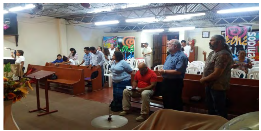
As we usually do before TPI classes in Villa el Salvador, we started that day praising and worshipping the Lord.