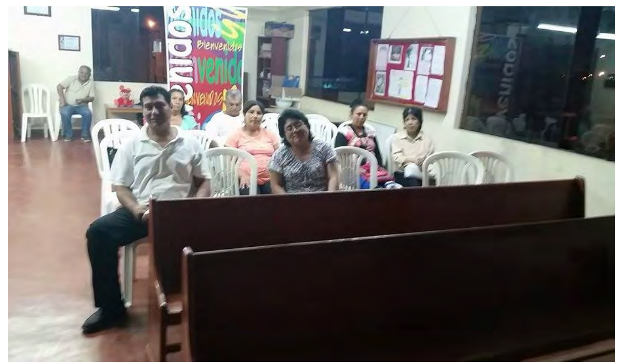
The other side of the class. They are also getting ready to start the lesson \odot