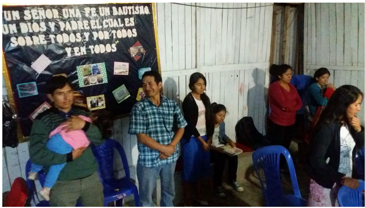
Of course, there were some people at the back as well. © Praise His Holy name!