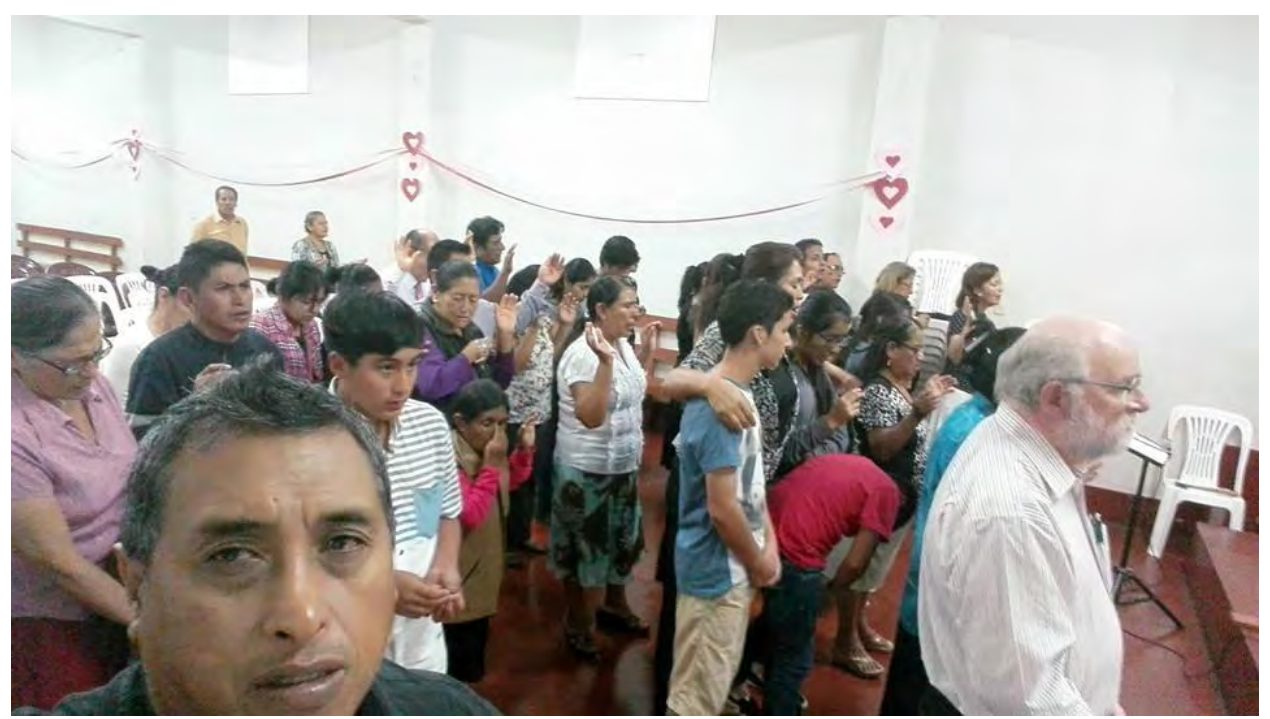
Our TPI brothers and sisters in Barranca worshipping our Lord. © One of the most important moments in the service.