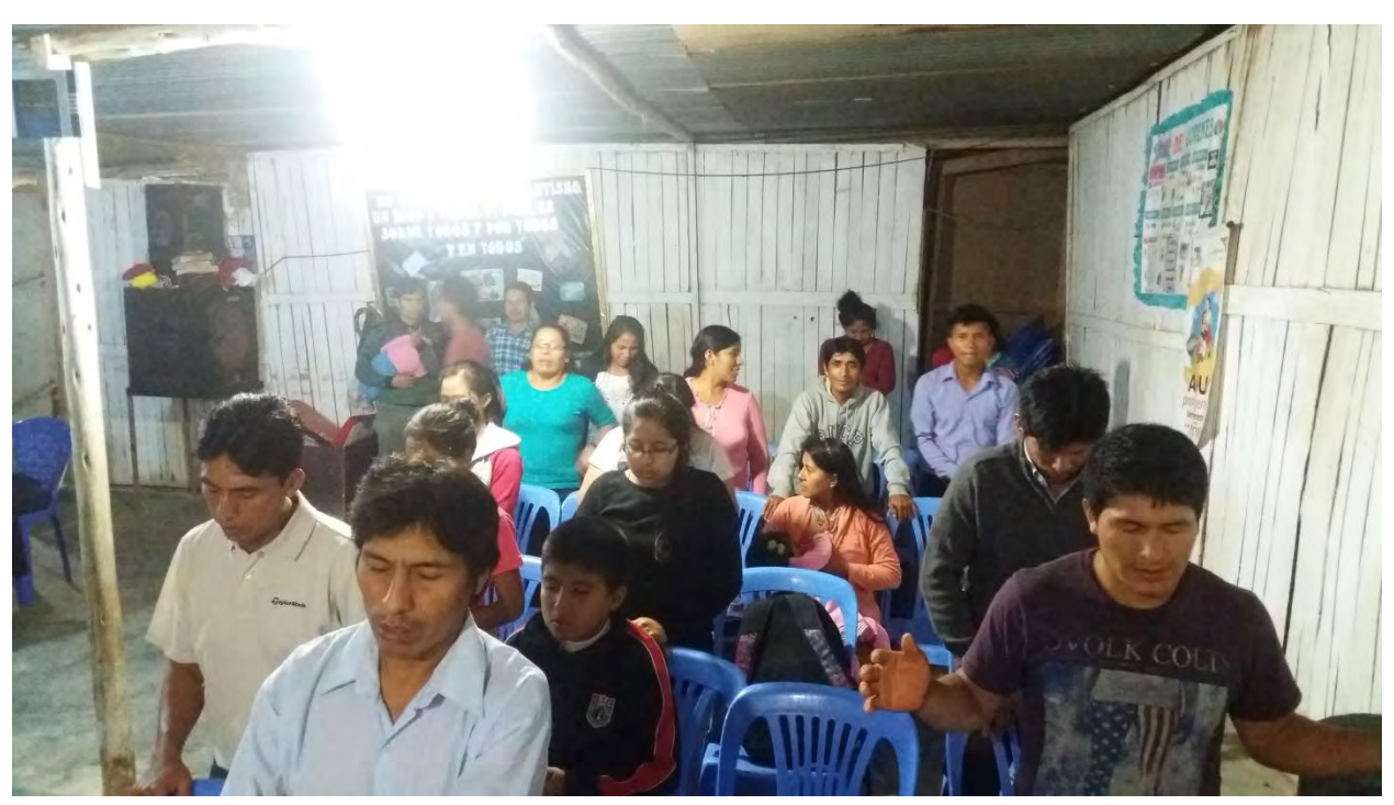
The other side of the class is also praying. All of us in the same spirit, sharing and learning together as real brothers and sisters in Christ. ©