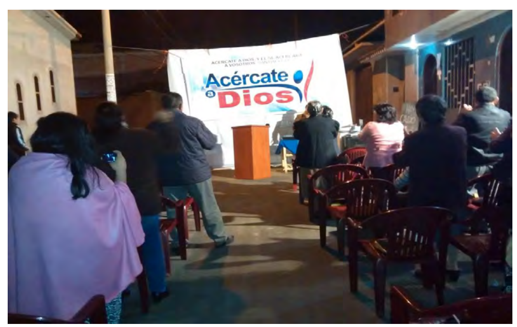
Our siblings in Christ are participating in an Evangelistic Campaign in Barranca with the objective of getting more souls to Christ. PTL!