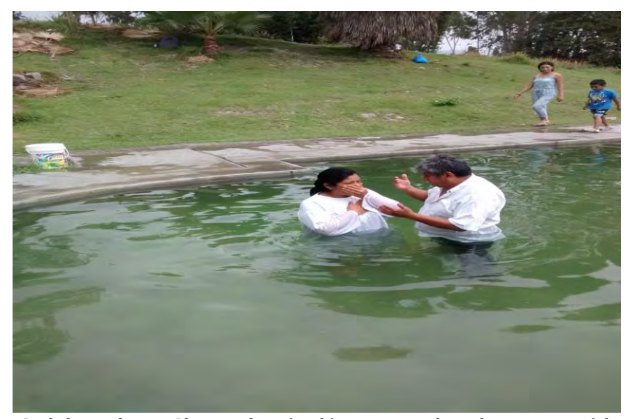
One soul for God through TPI! She was baptized in water and ready to go on with a Godly life! Thanks God!