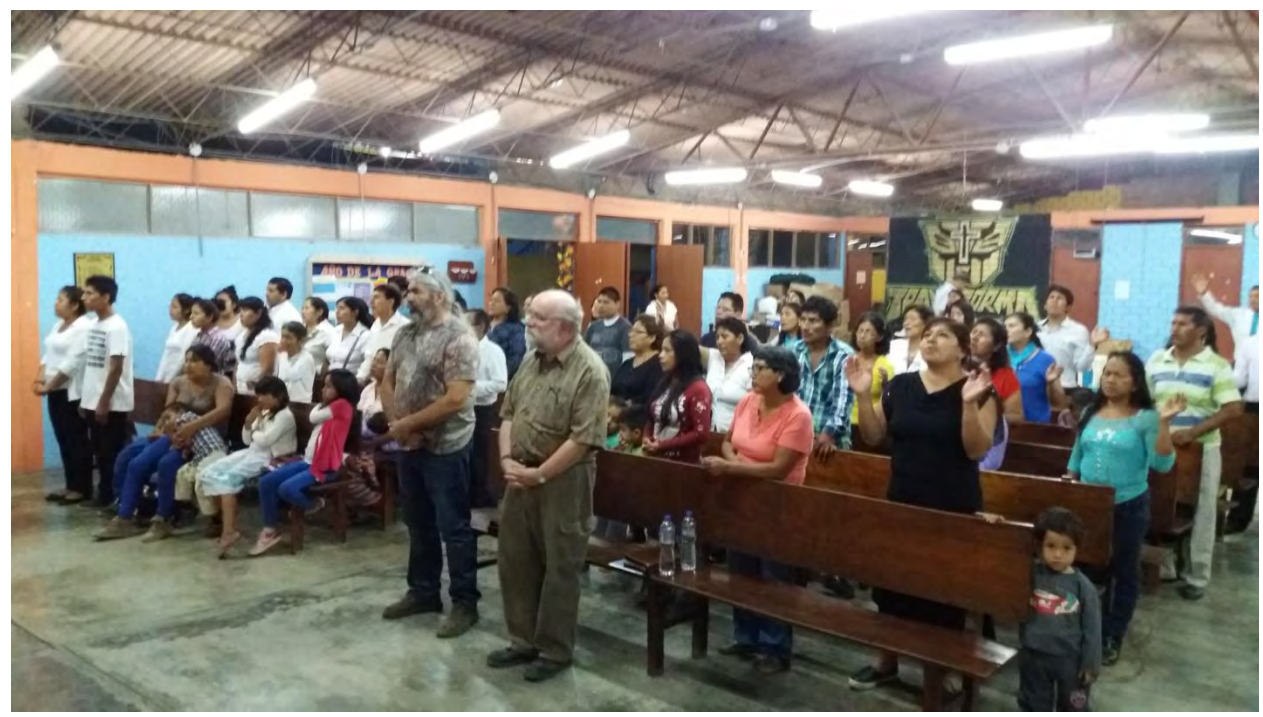
Praising the Lord before we start with the preaching. As you can see the church was crowded {\cal O}