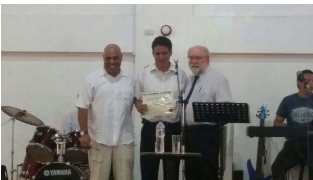
This is me getting the second quarter certificate! Thanks God, thanks family (wife and kids), thanks TPI.