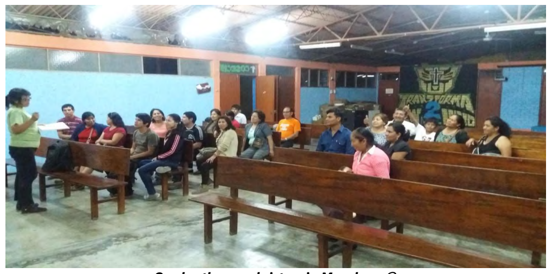
Our brothers and sisters in Manchay.

Now, we are studying quarter 2, the topic we are covering is how God sees the Bible Student. I'm really deepening on this topic as people in Manchay are really getting the message in their minds. One of the things we are trying to struggle with in Manchay is the perseverance to study the Bible. As you know, they have lots of financial difficulties as Manchay is a poor area in Lima, so they really work hard and the time to read or study is sometimes scarce as they need to sustain their families. So, I ask for your prayers so that all of the TPI class in Manchay gets ready to start their day praying and studying a portion of the Scriptures. 25 students attended the class.