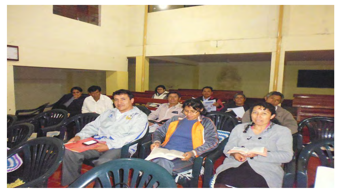
Very happy students in Carhuaz getting the Word of God.