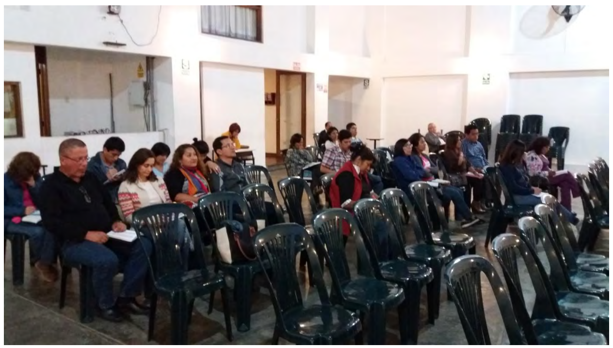
Another picture where you can see our faces. We are really happy for having TPI here. PTL!