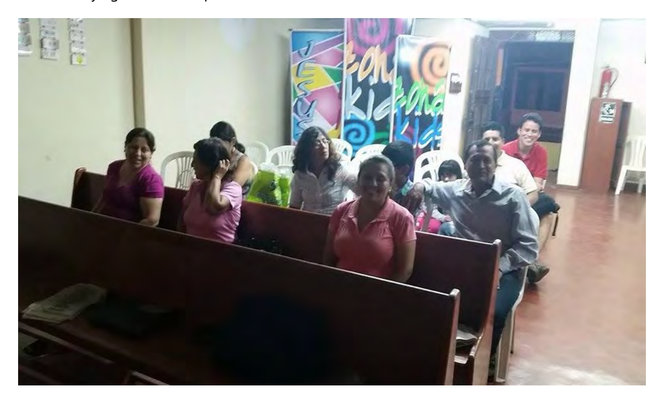
Getting ready to start the class. I'm at the back... @

Our brothers and sisters in this campus are just amazed by how the Scriptures can tell us many different things in passages we had already read, but we didn't understand completely. The topic being covered in this campus is the Family Altar, where both father and mother are responsible to carry this out, at our tables, while we are having lunch or dinner together as a family, which is a good opportunity to say thank you Lord for your blessings and to bless His Holy name. We now understand the importance of not watching TV or listening to the radio, but to take the opportunity to praise His name. It just opened up our eyes. The classes here are taught on Tuesdays from 7:30 to 9:30 in the evening. There are 20 students in this campus and we are studying the second quarter.