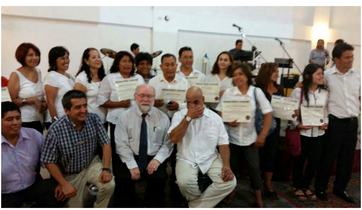
A photo of the whole TPI class after getting our certificates