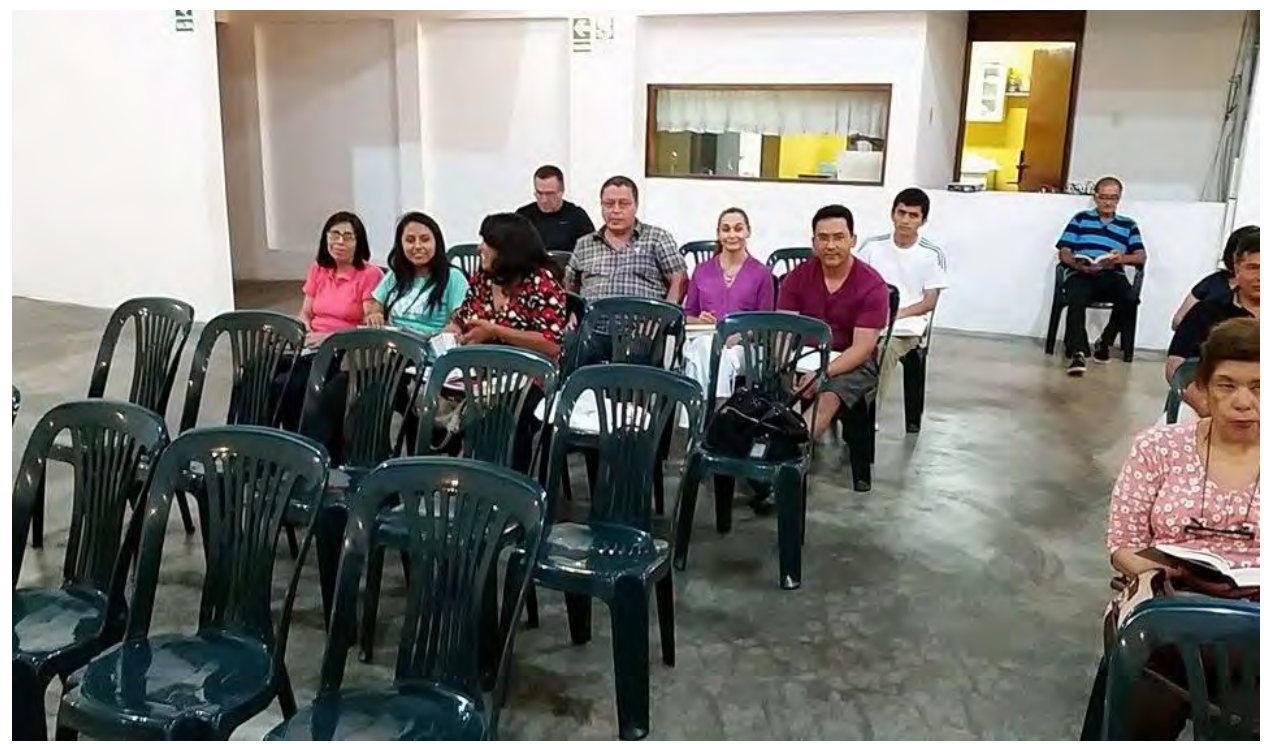
The other side of the class. Please pray so that this group of people perseveres in the attendance to these classes.