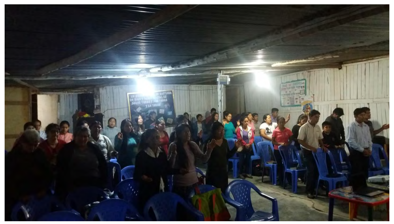
A photo of all the people in TPI Manchay. Please pray for all of them, so that they can go on with their studies with perseverance.