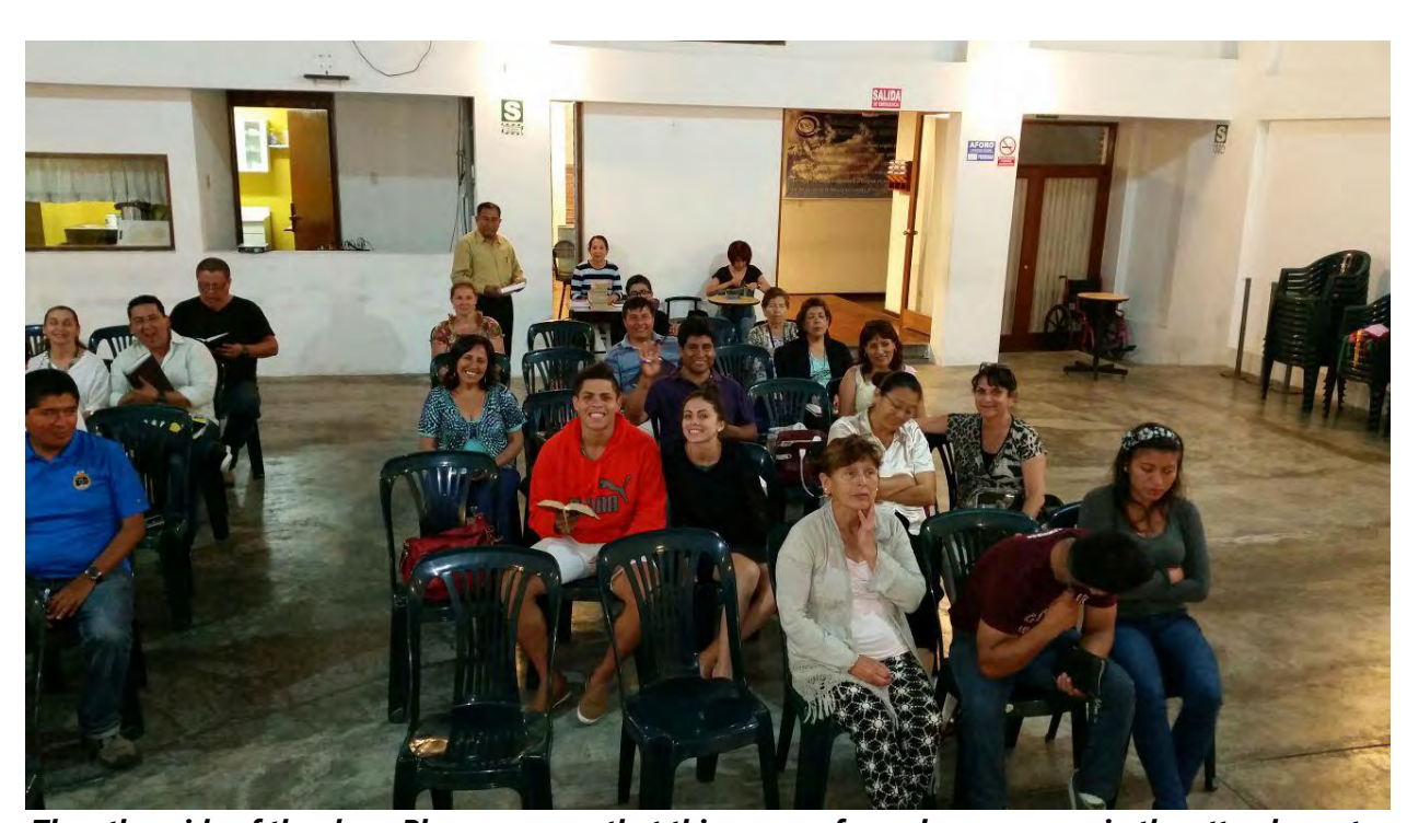
The other side of the class. Please pray so that this group of people perseveres in the attendance to these classes. Amen!