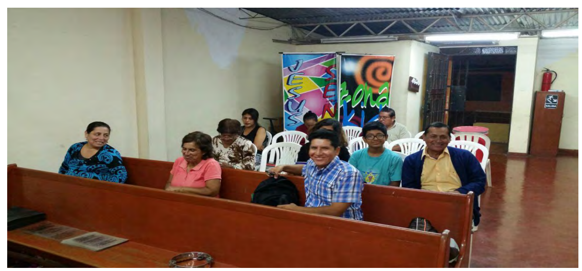
One side of the class. Everybody is happy to start! Hallelujah!

Our brothers and sisters in Villa el Salvador are on fire! They are a small church, only 25 people congregate there and still 20 of them are participating in TPI. They are about to finish quarter two, and the topic they are covering now is the blessings between parents and children. Last class, we were analyzing the Priestly Blessing in Numbers 6:22-27. They understood what it really means and how important it is for a priest, in this case all of us Christians, to pray for our children in this way and how important it is to declare with our mouth, what we wish for our children. There are 20 people attending TPI classes in this campus on Tuesdays.