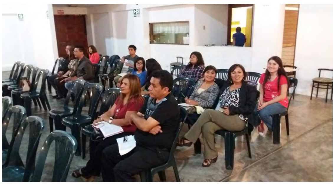
Another picture at the front of the class at the church temple. @