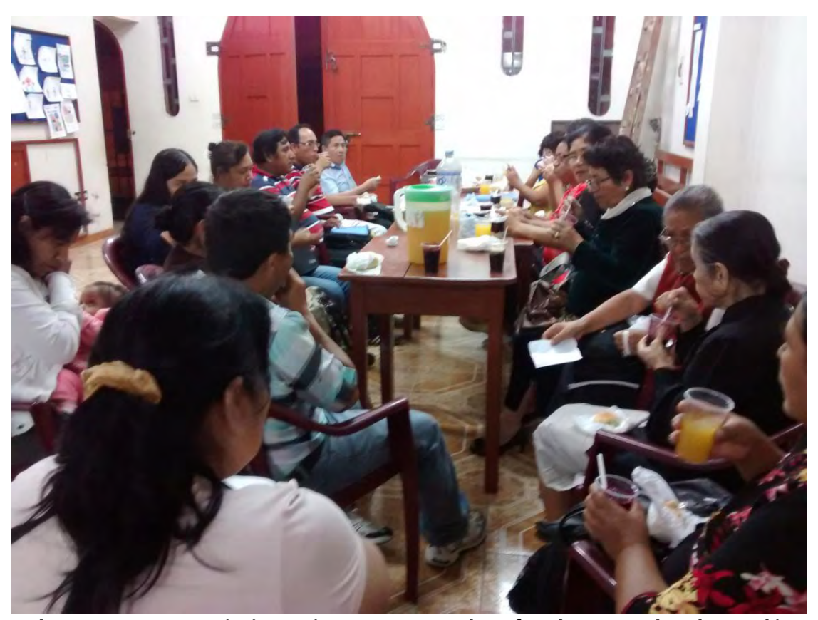
The two TPI groups enjoying a nice moment together after the exam. They deserved it!