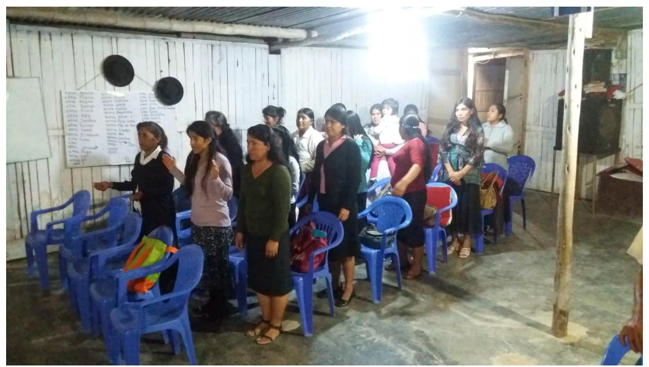
Our brothers and sisters at Luz Divina Church in Manchay. We are praying before we start classes.