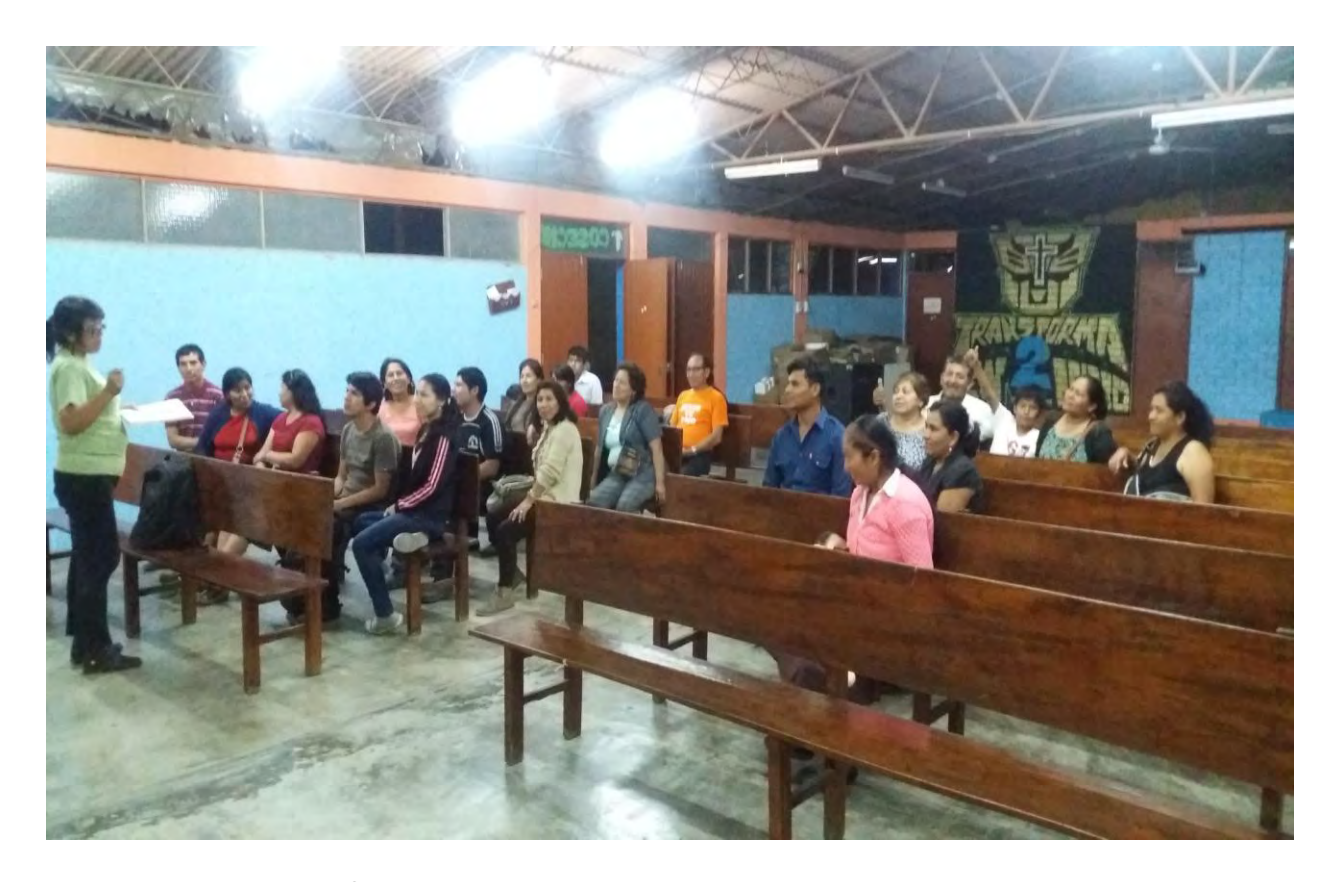
The complete class of TPI Manchay last week. There more people to come, but they had some previous events they couldn't cancel. This week, it will be better. ©