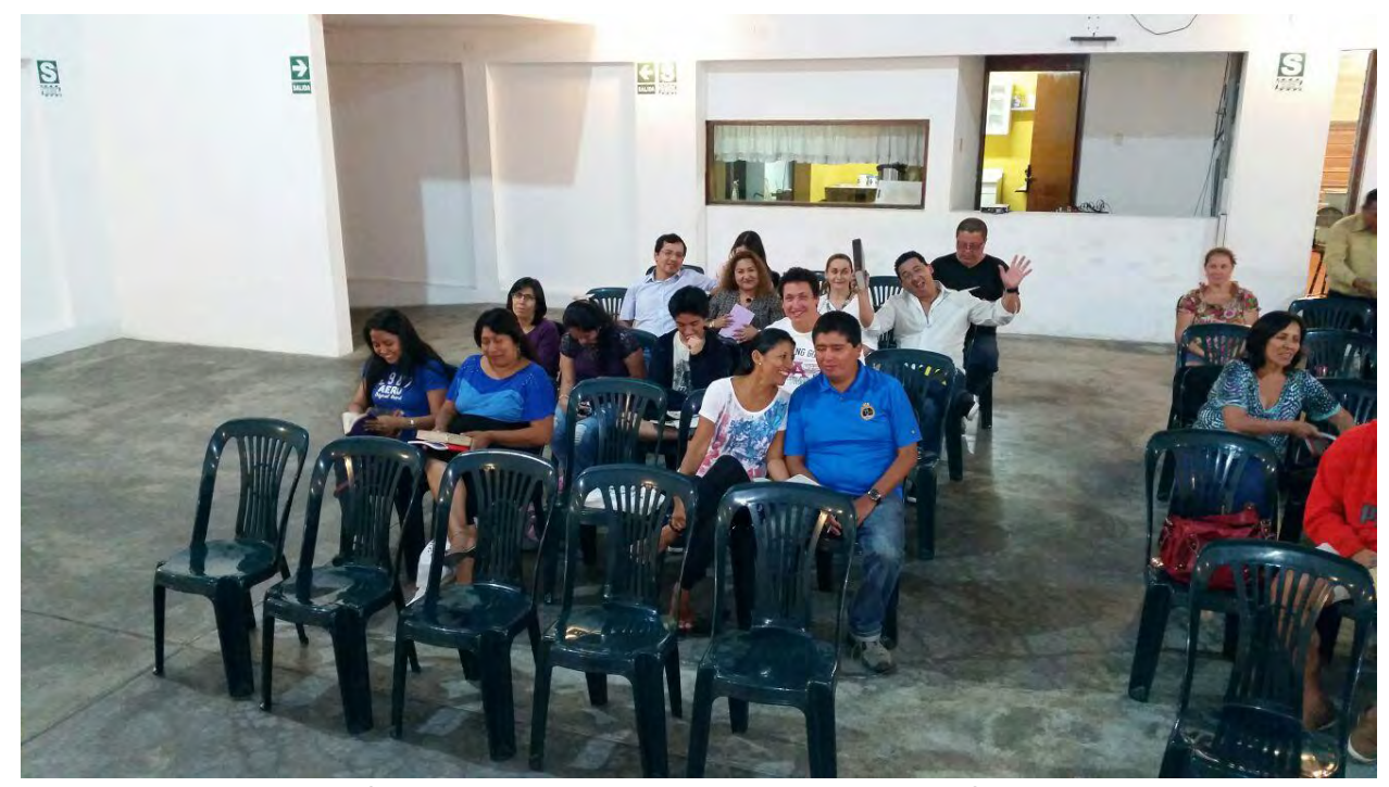
Photo of TPI class last Wednesday. This is one side of the class....