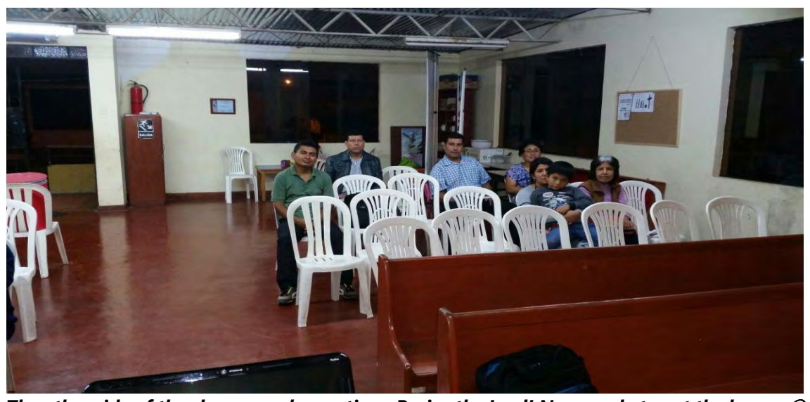
The other side of the class was also on time. Praise the Lord! Now ready to get the lesson \mathcal{O}