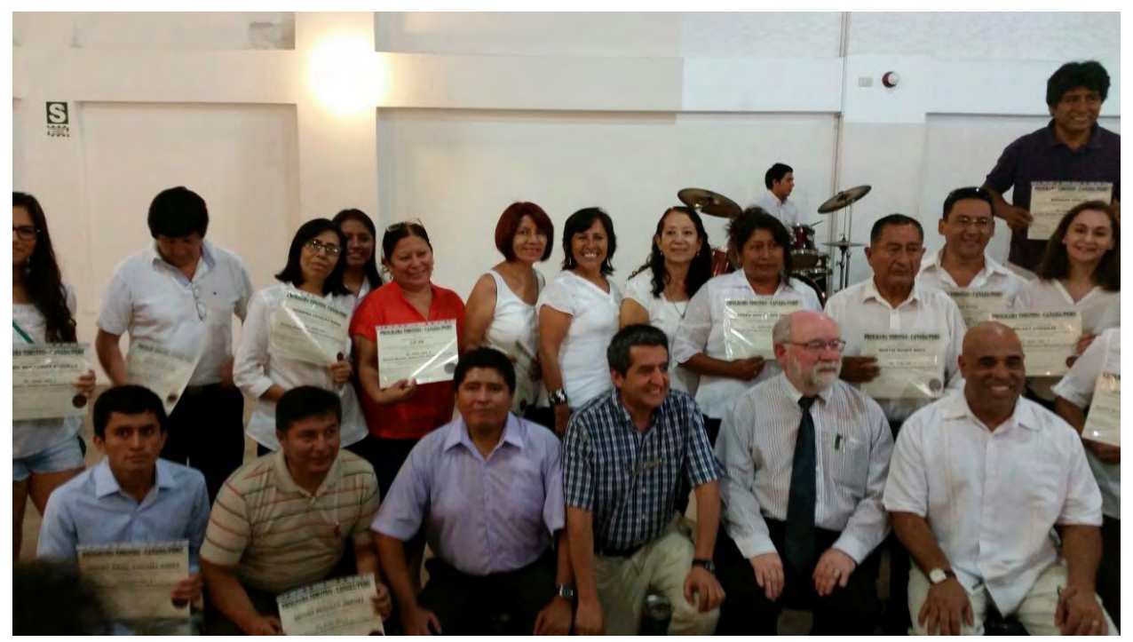
The second part of the photo. We were so many that we had to take two photos with the whole class. Hahaha. Praise His Holy Name.