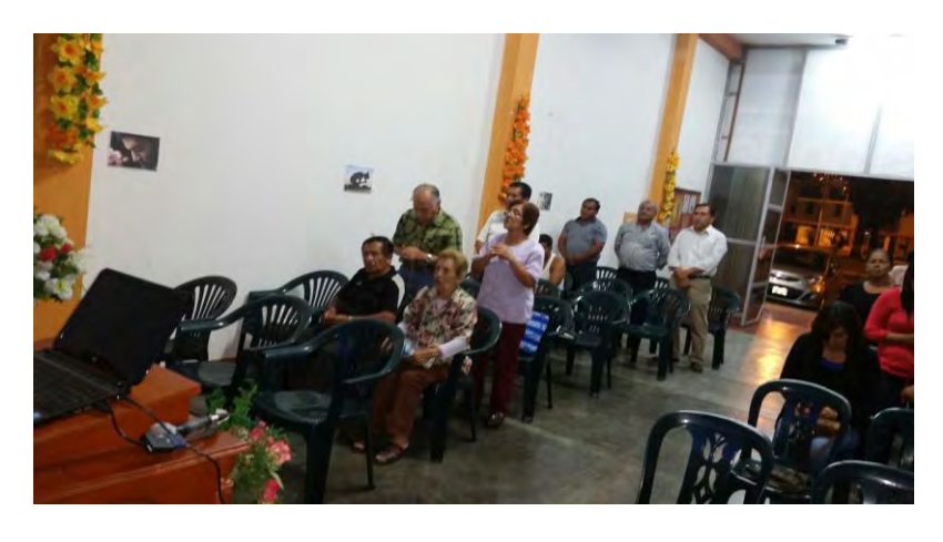
Our beloved brothers and sisters in Christ!

They are having classes on Thursdays, from 7:30 to 9:30 in the evening. Our brothers and sisters in Christ are doing quarter 3 and they already studied what tithing means and the principles for doing it. Now they are going to study how to deal with tithing in our lives and how God sees it. The number of students attending this campus is 23. It has increased after the change of schedule. Praise the Lord! ©