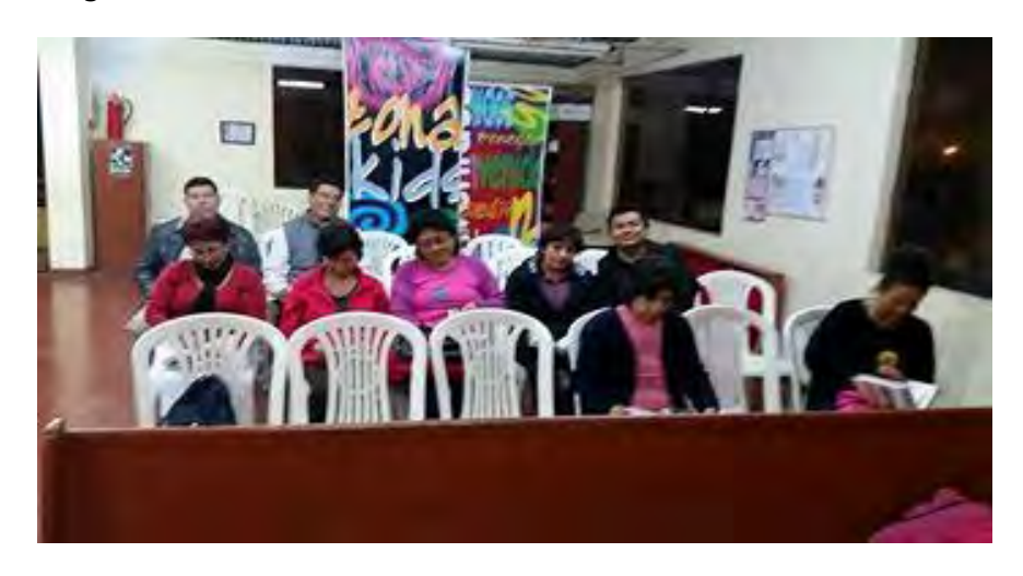
They are the punctual ones! It is important to mention that they really understand they aren't punctual to the pastor, but to God. Please pray so that this class goes on with this idea of punctuality ©

This small church is about to finish quarter two. Our brothers and sisters are looking forward to having the exam and go on with quarter 3, which is about tithing. The topic they are covering now is the blessings between the husband and the wife. Last class, they learned how important it is to remember that the wife plays a key role in the family and how pleased God is when a woman really becomes the one in Proverbs 31. The people in Villa el Salvador got the idea of the importance of the wife in marriage and how important it is for a husband to protect their wife's heart. There are 20 people attending TPI classes in this campus on Tuesdays, from 7:30 to 9:30 in the evening.