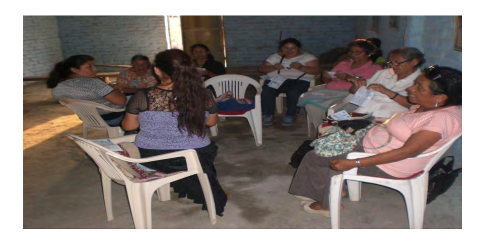
TPI students getting ready to pray before they start their campaign!